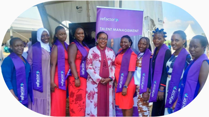
Graduants from Kawempe Youth Centre ATC