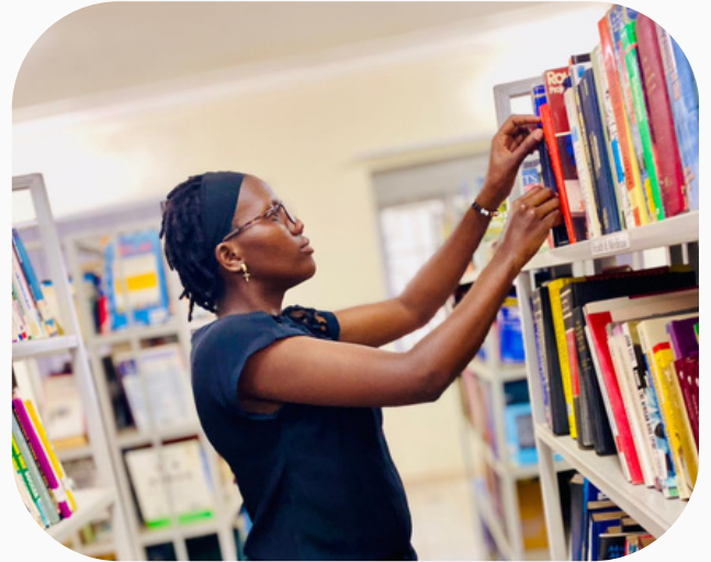
On the left, Children at the Buganda Kingdom Library and on the right, a user picking a book from the shelf at the same library.