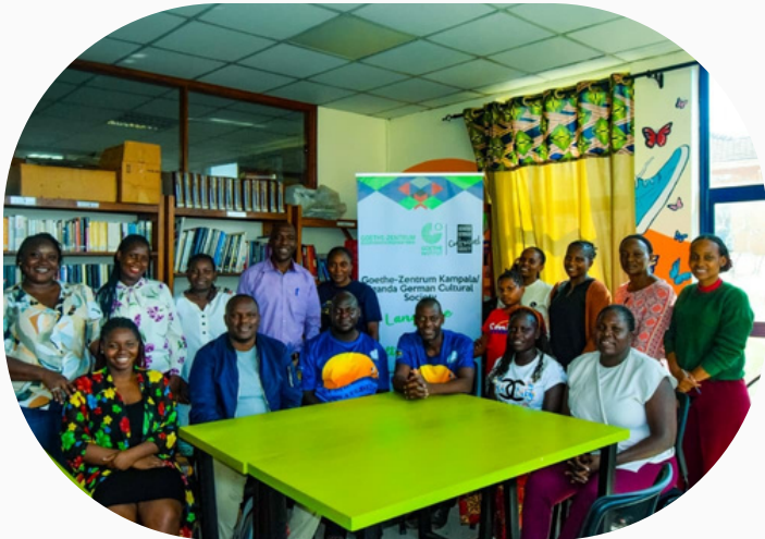
Participants pose for a group photo with Goethe-Zentrum Library staff at the end of the training.

COLAU partnered with the Goethe-Zentrum Library to carry out a 4 days capacity building exercise for 11 librarians representing 6 community libraries. For each of the 4 days, topics discussed were; Collection Development, Book Processing, Automation of library services and social media marketing, respectively.