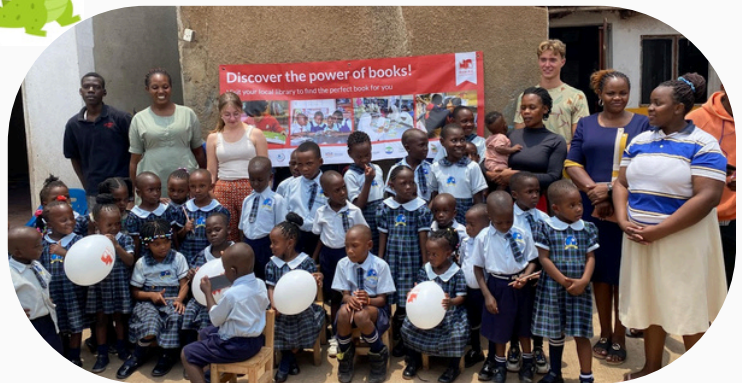
Some of the children, school staff and KYC library volunteers pose for a photo after the activities.