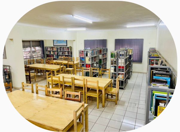
Buganda Kingdom Library

Beyond being a traditional library, the space functions as a specialized research centre serving students, cultural scholars, writers, and visitors seeking verified and well-documented information on Buganda and beyond. Access to the collection is structured to support serious study and academic inquiry, ensuring that users engage with reliable sources that uphold historical accuracy and cultural integrity.