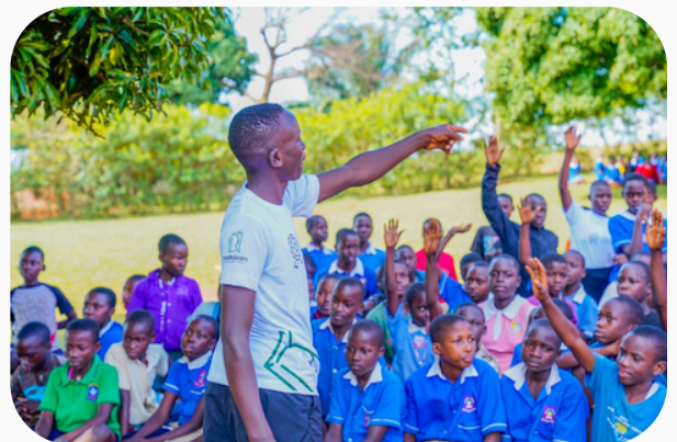
A literacy Champion taking pupils through literacy sessions.

Amongst their programs is the Literacy Champions Fellowship, in which they equip 13 to 18-year-olds to lead literacy initiatives in underserved communities (community libraries, slums, refugee settlements, and public schools).