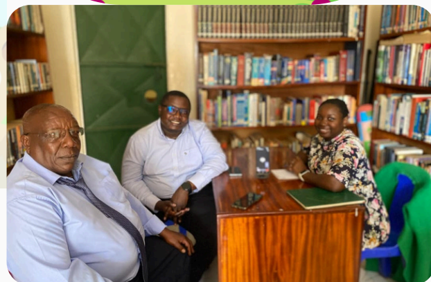
Representatives from Ubongo meet at the secretariat with the COLAU Coordinator.