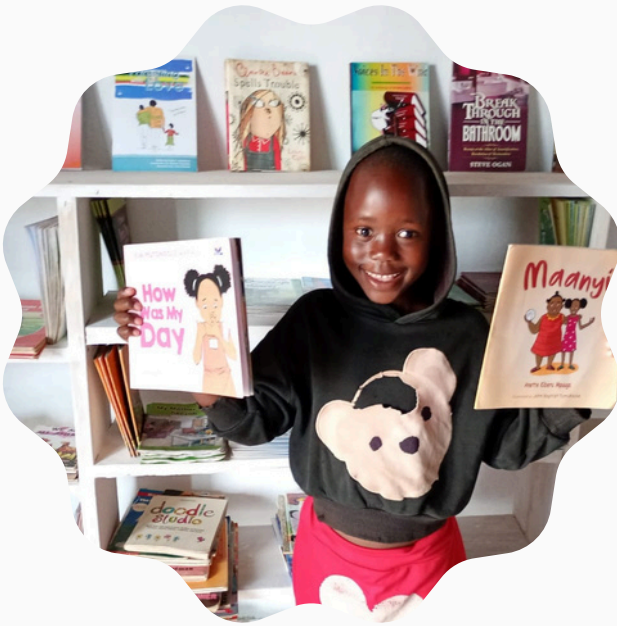
Children at Motherly Heart Organisation's Community Children's Library