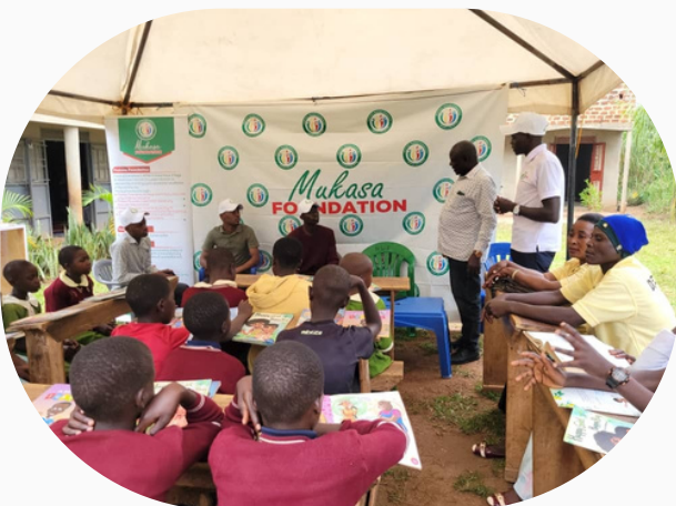
Children and parents at Mukasa Foundation

In the latter, learners of Mukasa Foundation Nursery and Primary school, the adult learning class of Mukasa foundation Community Library, Guests from Ryan Okello Foundation Kenya, community leaders and Mukasa foundation community joined the rest of the world to celebrate and actively participate in celebrating this year's International Literacy Day through reading, reciting poems, singing, loud story-telling and tree planting for environment conservation.