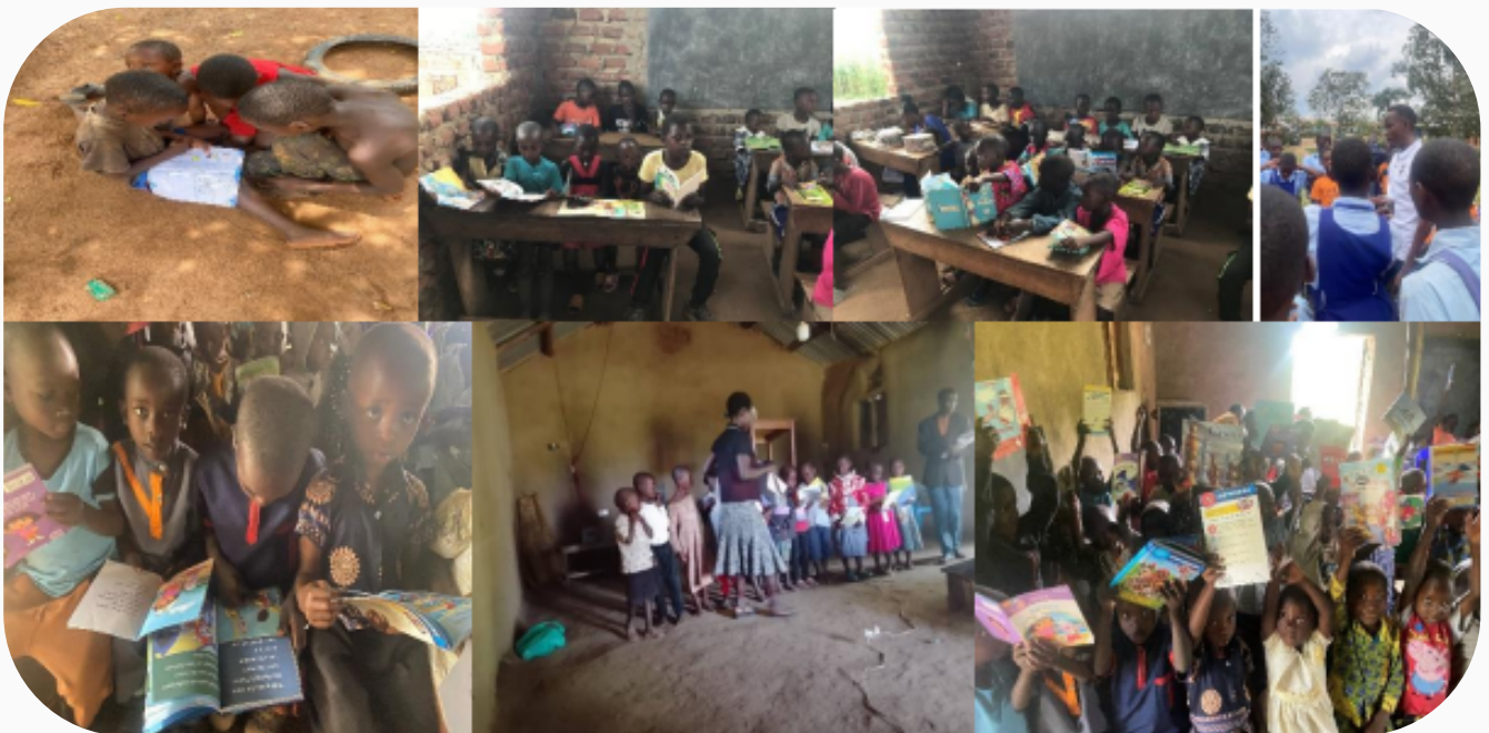
Activities at Echo Rural Arise Africa