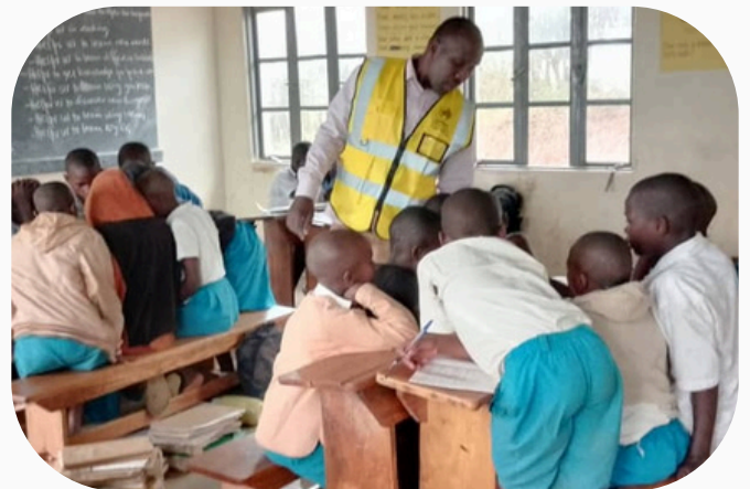
An outreach activity in one of the schools Nyungu Streams Community Resource Centre works with.