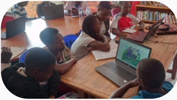
Some of the Reading Promotion volunteers watching an educational video at Nyarushanje Community Library