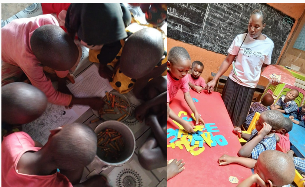
Children at Centre for Children and Library Foundation ( CECLIF)

Centre for Children and Library Foundation ( CECLIF) is located in Abwanget, Katakwi district in Eastern Uganda. The children in the community spent their time at the Library on International Literacy Day 2025.