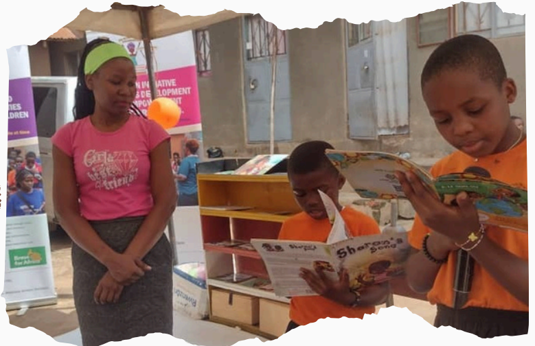
Pupils reading out aloud to fellow students at Mummy Foundation Library

Other COLAU member libraries that commemorated the literacy day celebrations were; Nyarushanje Community Library, Amuno Rural Hub-COLAU's latest member library and Mukasa Foundation Community Library.