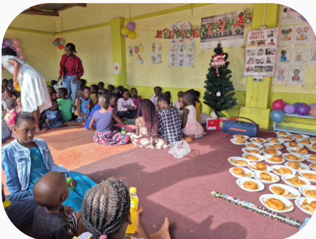
Christmas party at Tusome Children's Resource Centre