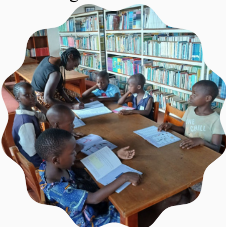
Children reading at Busesa Community Library

Busesa Community Library is located in Eastern Uganda on Bugiri Road. This library serves the community through a variety of services ranging from a children's clinic, modern library services, computer literacy and music dance and drama among others.