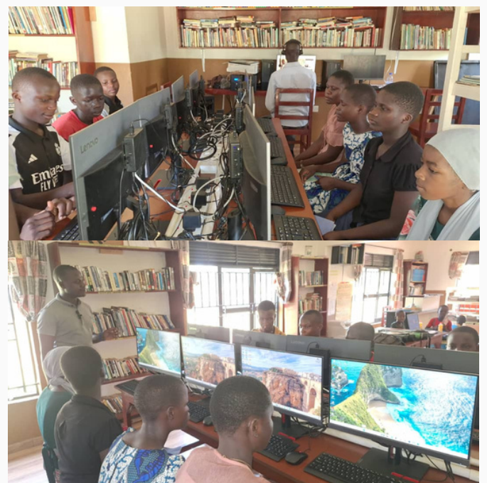
ICT Training at Bugodi Community Library