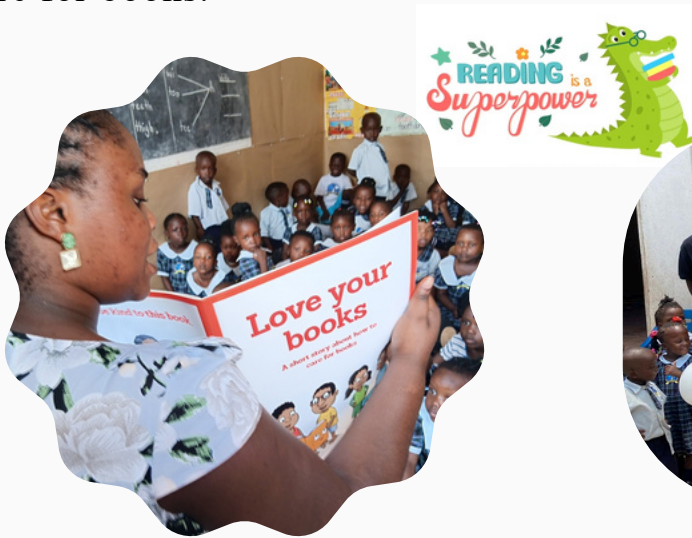
One of the staff at KYC reading aloud to the children on how to take care of books.

Other celebrations, courtesy of Book Aid International, were held at Kawempe Youth Centre in partnership with Famy Primary school. Children enjoyed a series of activities such as balloon spelling games, information for young adults on digital platforms available to enhance their education, read-alouds, and sessions on how to care for books.