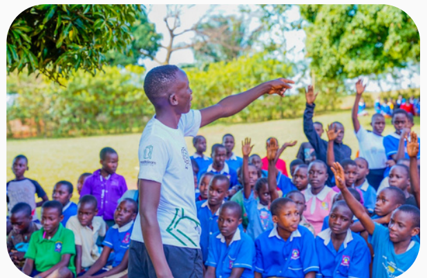
A literacy Champion taking pupils through literacy sessions.

Amongst their programs is the Literacy Champions Fellowship, in which they equip 13 to 18-year-olds to lead literacy initiatives in underserved communities (community libraries, slums, refugee settlements, and public schools).