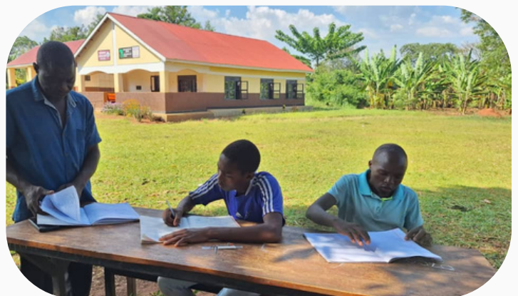
After school lessons for students within the Bugodi Community Library vicinity