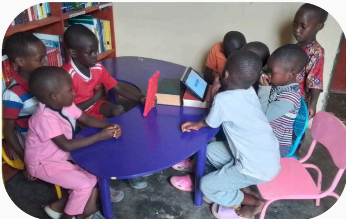
Children at Nyungu Streams Community Resource Centre watching videos on the tabs.

Last year, under the Uganda Community Knowledge Project supported by Book Aid International through COLAU, they received about 10 tablets and a RACHEL gadget that gives out a WiFi signal to access numerous information materials such as ebooks, videos and audios. These have greatly enhanced their reading activities at the library and in the Community amongst the schools they work with.