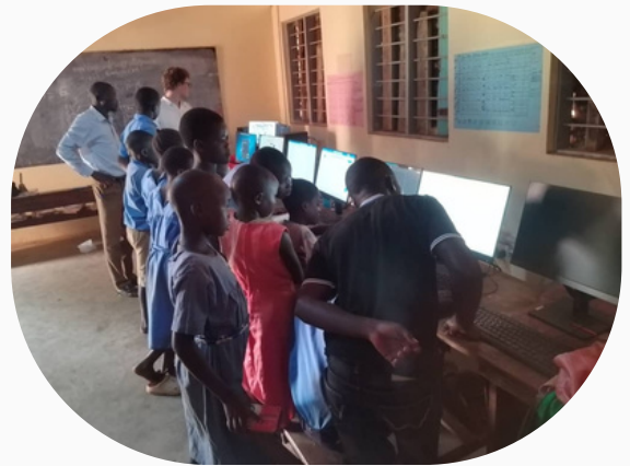
Children during a computer literacy lesson at The 6 Community Libraries.

The 6 community libraries serves the community through; library services, Information Communication Technologies and outreach services. Below is a photo of an American peacecorp teacher training pupils of Nakoola Primary School to use computers.