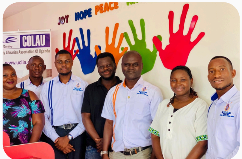
COLAU representatives represented by 2 board members & the Coordinator pose for a group photo with the staff from the Buganda Kingdom Library.