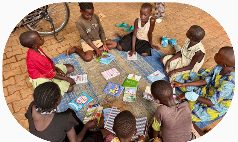
Children at Amuno Rural Hub engaged in individual reading